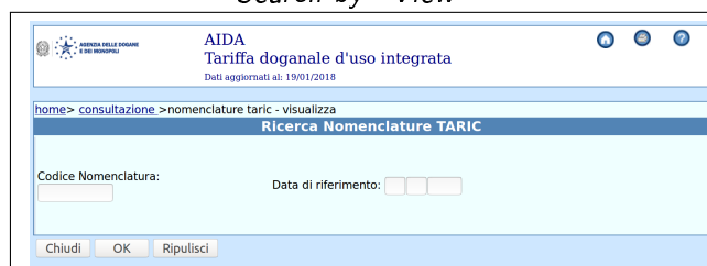
Search by "View"

In the Nomenclature Code field it is possible to insert the first 4 digits of a Combined Nomenclature code. For example, enter the code 8703. The portal will present the structure of the Combined Nomenclature associated with this code up to the 10-digit TARIC codes. The result of this research is presented in the following figure.