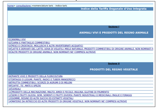
Search by "View"

The Combined Nomenclature is organized in Chapters, represented by the first two digits. For example, the chapter 87 is the chapter that contains the codes relating to CARS, TRACTORS, SPEEDGERS, MOTORCYCLES AND OTHER LAND VEHICLES, THEIR PARTS AND ACCESSORIES.